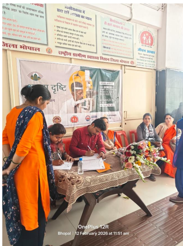
OnePlus 12R Bhopal | 12 February 2026 at 11:51 am