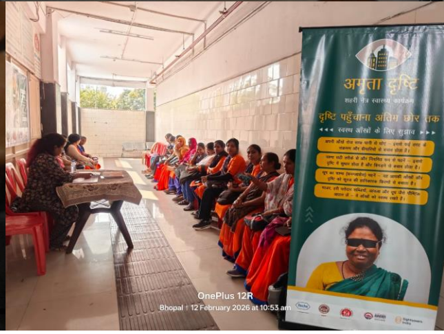
OnePlus 12R Bhopal | 12 February 2026 at 10:53 am